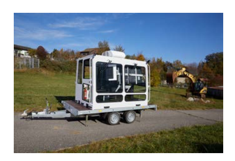
Optional: the cabin can be supplied on a road trailer fitted with stabilisers for levelling.