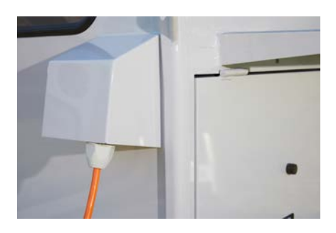
A 16A three-phase electrical connection provides power to all the equipment in the cabin.