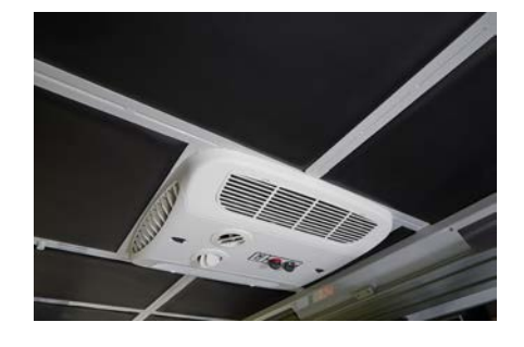
A heater/air-conditioner ensures a comfortable operating temperature in all weathers.