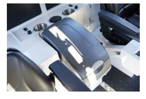
A small refrigerator, DAB+ radio, cup holders, USB chargers, interior lighting and windscreen wipers provided for the comfort and safety of the operator.