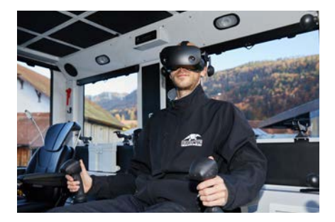
In addition to the screens, a stereoscopic view through a VR headset allows precision operations to be performed as if you were in the machine.