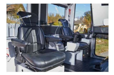
One operating station equipped with joysticks and pedals.

Optional: two independent operating stations.