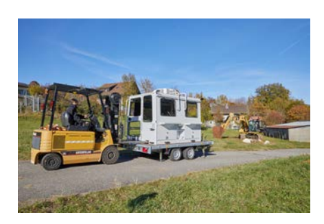
The cabin can be moved using a forklift truck. Lifting points also allow the cabin to be moved by crane.