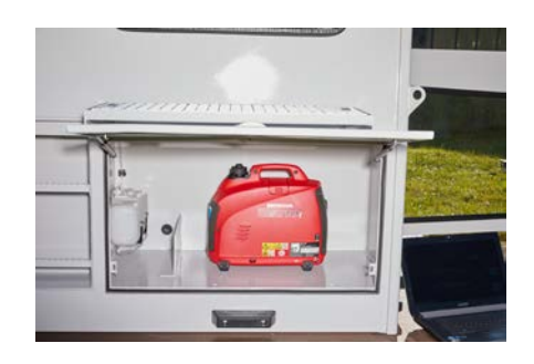
A back-up generator can be provided to ensure minimum control functionality.