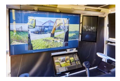
Customisable screens permitting ergonomic views of the cameras and machine parameters.

Optional: two independent operating stations.